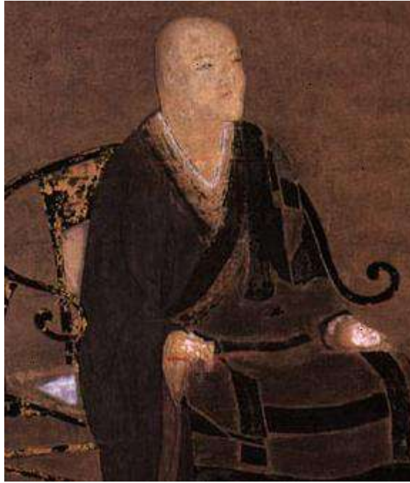
Bodhidharma who went to the East

A CATALOGUE OF INVERTED LOGICS, like a philosophical pathology of the modern world.