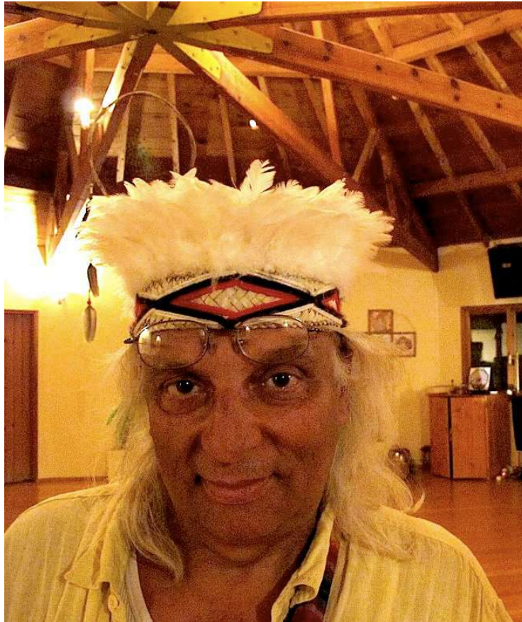
Wearing a shamanic hat, workshop at Quinta da Calma.