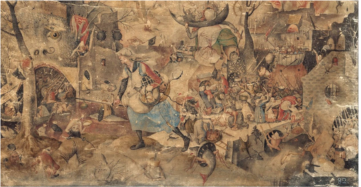
Dulle Griet, Bruegel the Elder 1561, Antwerpen